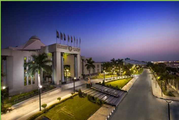
Misr University for Science and Technology (MUST)